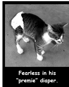
Fearless in his "premie" diaper.

Despite some well-intentioned but misinformed word of mouth that has left some people with misconceptions about us, Safe Harbor is not a hospice or a dumping ground for sick animals. We don't know-